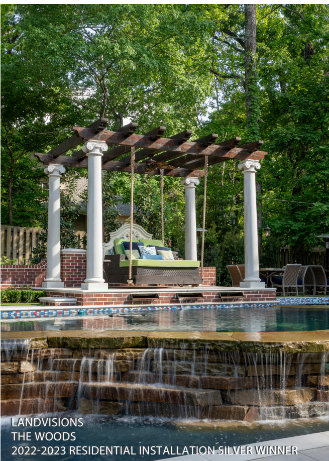
LANDVISIONS THE WOODS 2022-2023 RESIDENTIAL INSTALLATION SILVER WINNER