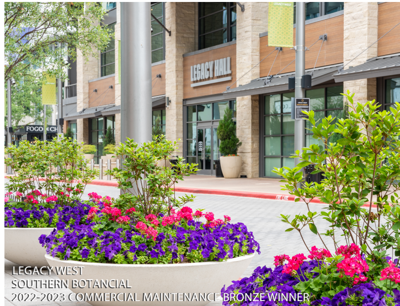
LEGACY WEST SOUTHERN BOTANICAL 2022-2023 COMMERCIAL MAINTENANCE BRONZE WINNER