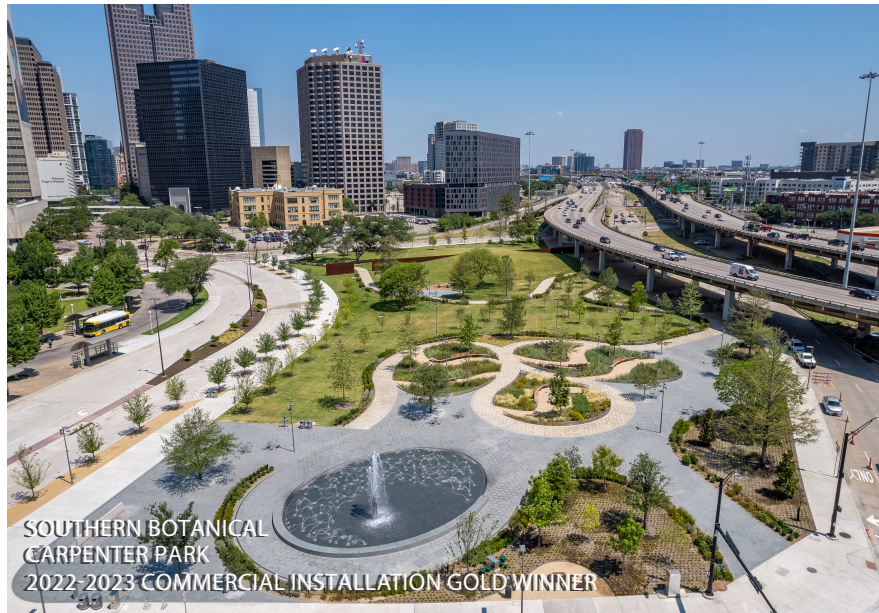
SOUTHERN BOTANICAL CARPENTER PARK 2022-2023 COMMERCIAL INSTALLATION GOLD WINNER