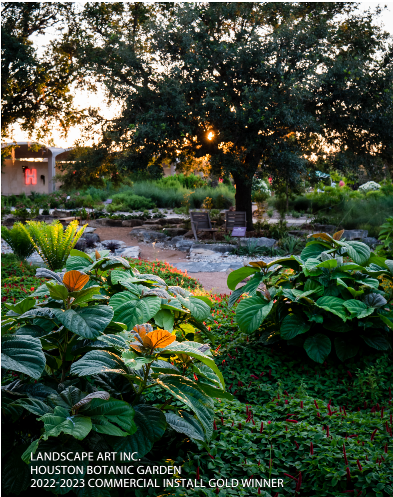
LANDSCAPE ART INC. HOUSTON BOTANIC GARDEN 2022-2023 COMMERCIAL INSTALL GOLD WINNER