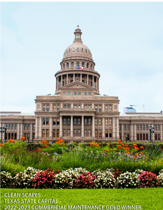
CLEAN SCAPES TEXAS STATE CAPITAL 2022-2023 COMMERCIAL MAINTENANCE GOLD WINNER

Design Category – The Design Category focuses on the design of a completed project. You must submit a photo depicting the landscape design plan (delete your company name from the plan). The entering firm must have created the landscape design and the installation must be complete. Your description should focus on the client's request, and how your landscape design met his or her specific needs. Do not forget this is a design project — include photos about how the project overcame any special challenges.