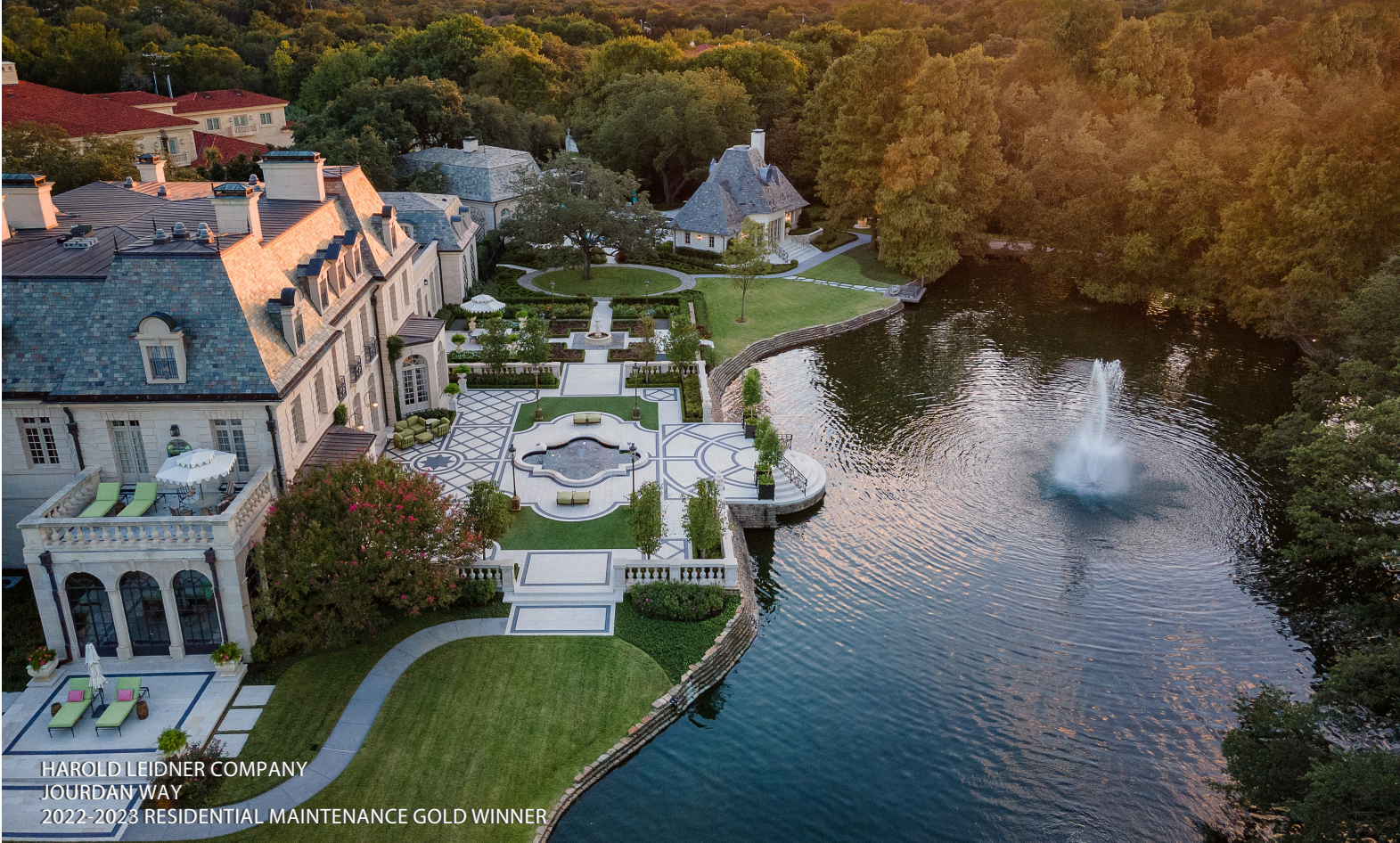
HAROLD LEIDNER COMPANY JOURDAN WAY 2022-2023 RESIDENTIAL MAINTENANCE GOLD WINNER