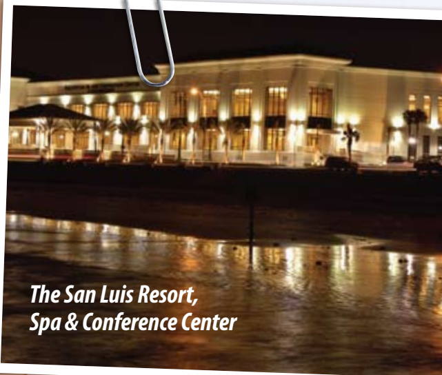
The San Luis Resort, Spa & Conference Center

To reserve your hotel room, call: The San Luis Resort at 800-392-5937. For special TNLA rates call before December 29, 2009.